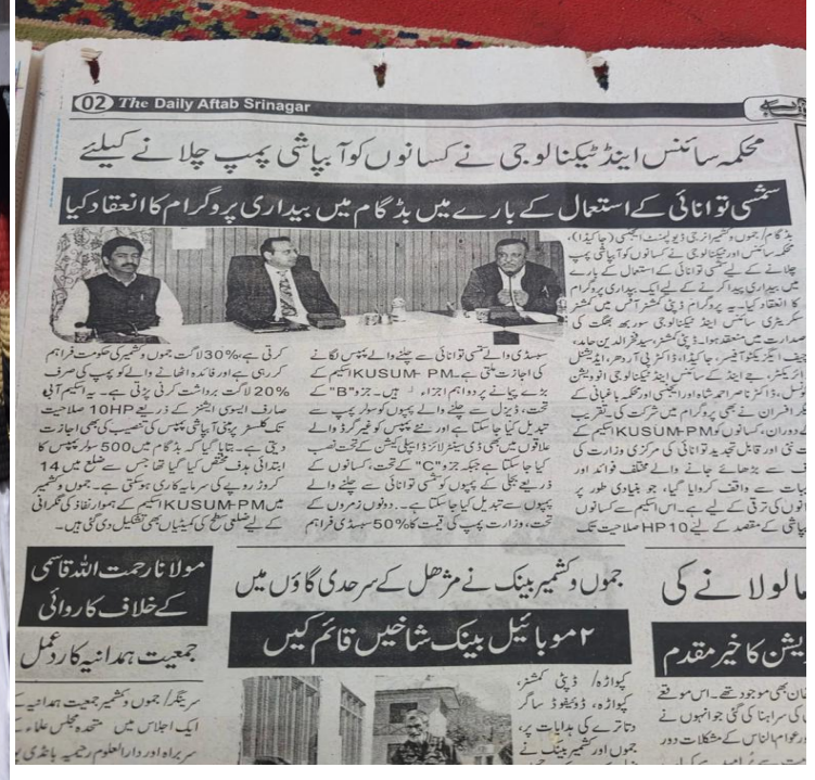
Commissioner/Secretary, Science & Technology Department & District Development Commissioner Budgam to various stalls showcasing the equipment used in Small Hydro Power Projects during the launch of Solar Powered Agriculture Pumps scheme at Budgam