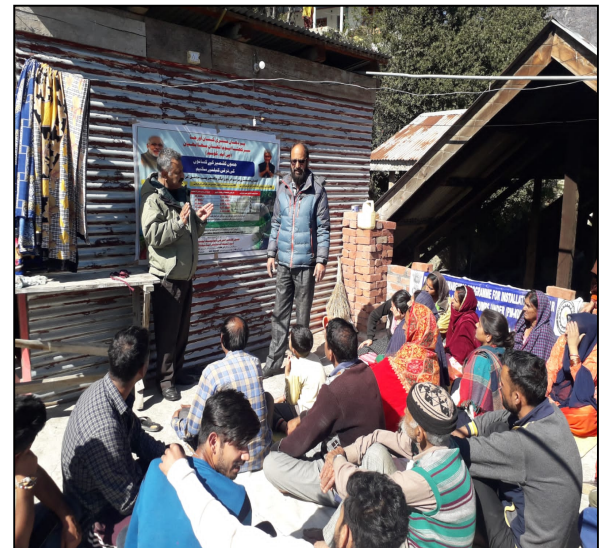
Village Dassa Block Nagsini District Kishtwar