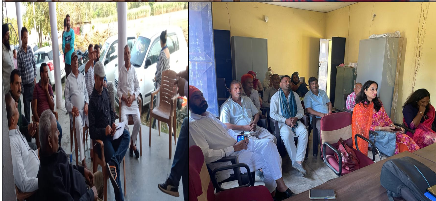
Block Marh District Jammu Block Bhalwal District Jammu